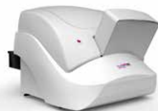
Pannoramic 250 Flash II